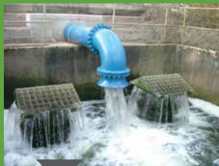
24 Hours Water Supply