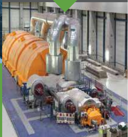
24/7 Electricity (Project own Turbine)