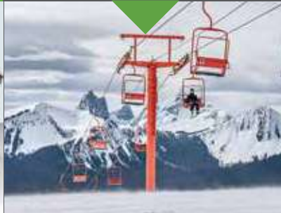
Proposed Chair Lift at 350 meters