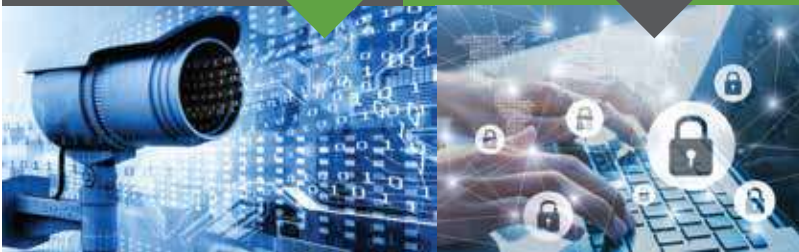
24 Hours Security & Surveillance