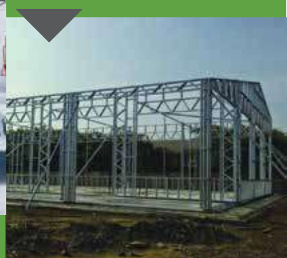
Earthquake Resistant Structure